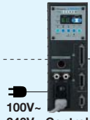
Control Unit NE211 NE211-OP1